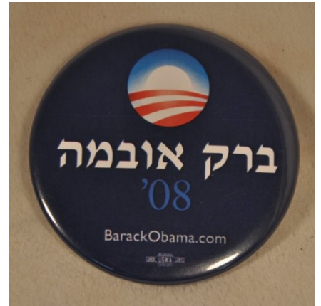
Obama button in Hebrew