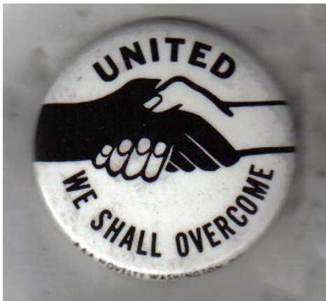
Civil Rights button