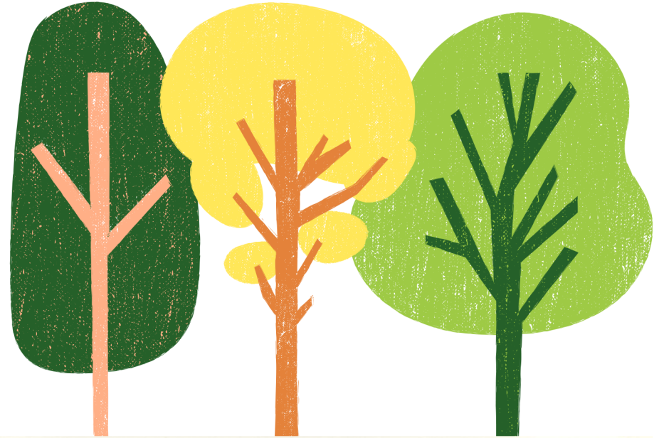
Camp Airy, 1970.