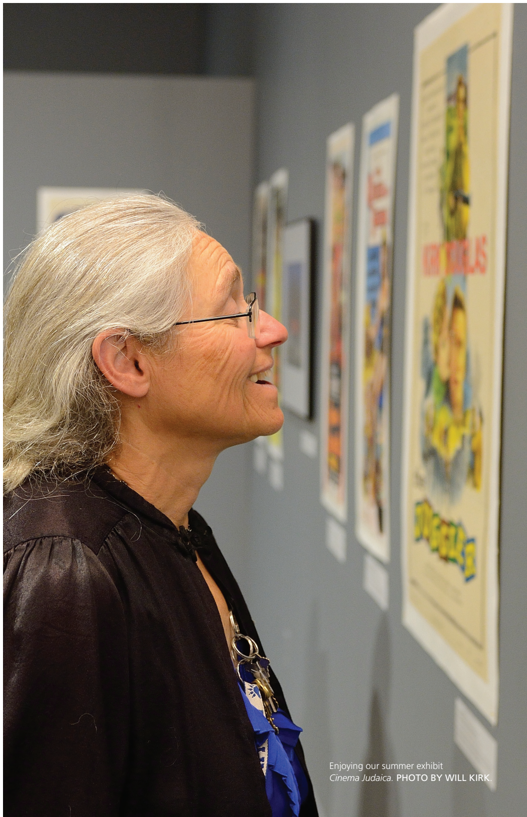
Enjoying our summer exhibit Cinema Judaica .