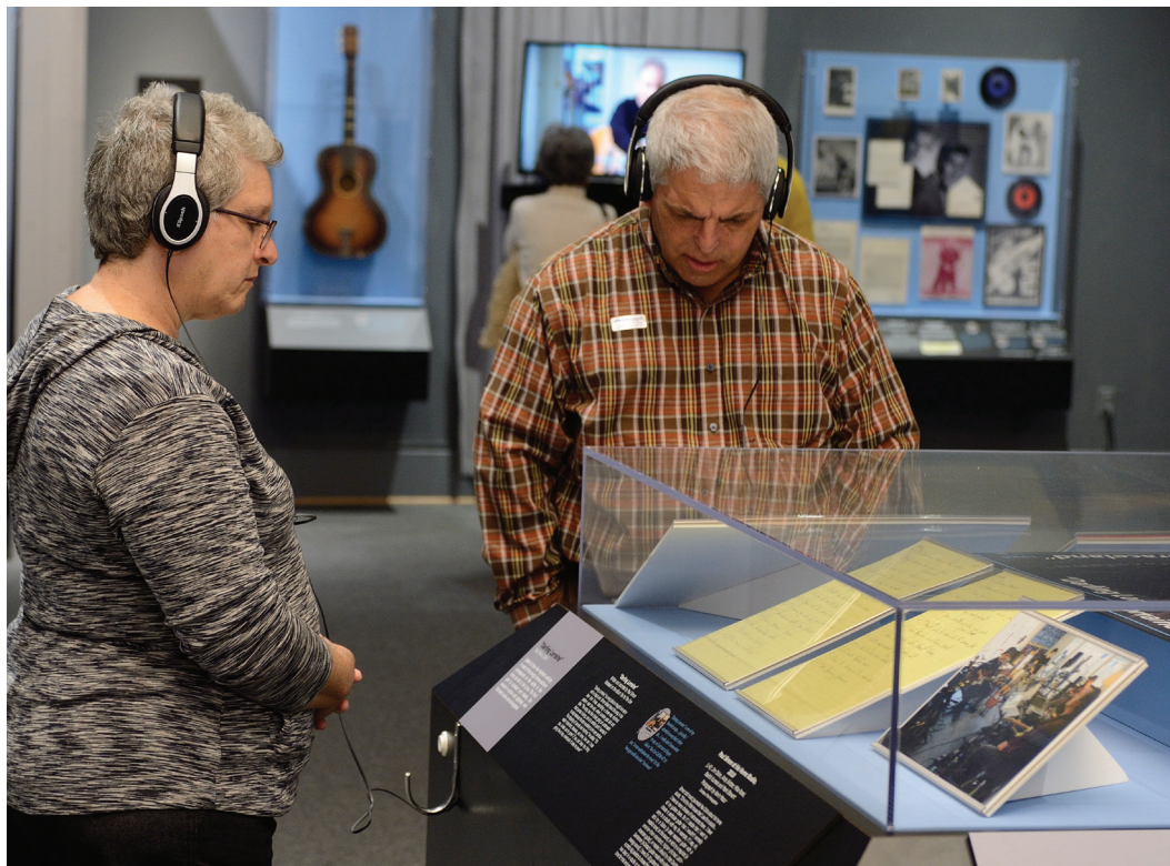
Museum visitors engage with the history of famous tunes in Paul Simon: Words and Music .