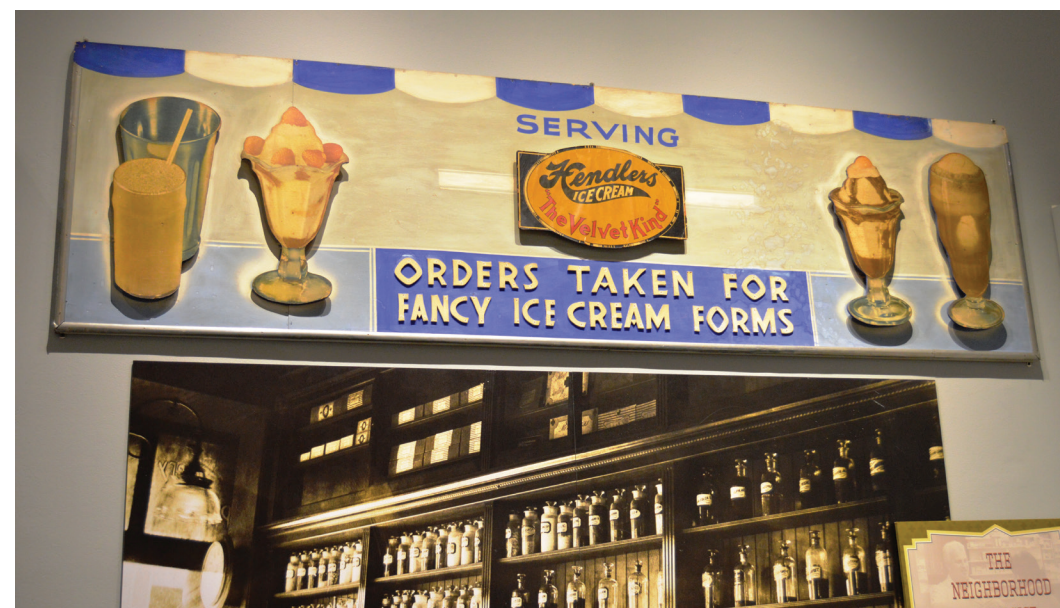
A Hendler's Creamery advertisement sign, on display in Beyond Chicken Soup: Jews and Medicine in America .