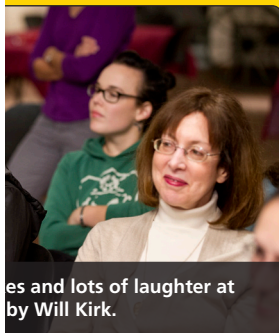
es and lots of laughter at