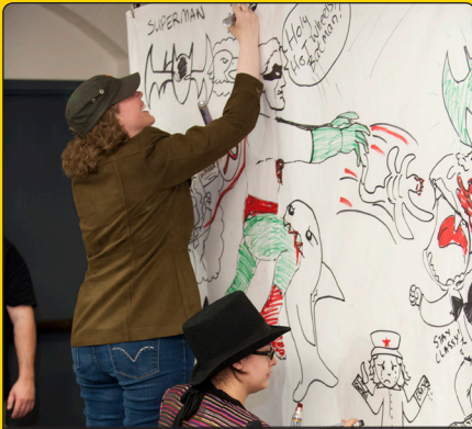
Cartoonists delight the crowd at the very first museum-edition of Super Art Fight!