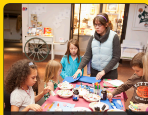
Old Bay meets the Chesapeake Bay with our spice-decorated fishbowls at GefilteFest.