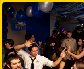
Enthusiastic dancing at this year's Purim Prom-demonium!