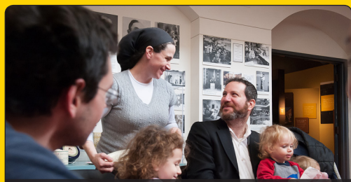
Enjoying family crafts at Dragons & Dreidels, our 2012 Christmas Day program.