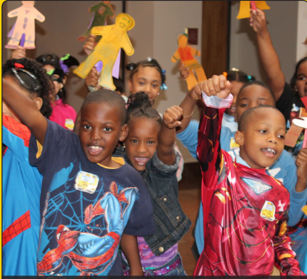
Moravia Park students create their own superheroes on a visit to Zap! Pow! Bam!