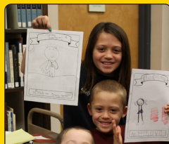
Some great results at our "Create Your Own Comicbook" workshop!