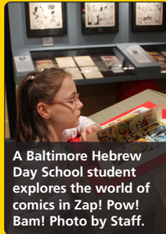
A Baltimore Hebrew Day School student explores the world of comics in Zap! Pow! Bam!