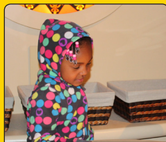
Our PreK @ Play visitors had a great time in our Synagogue Speaks exhibit.