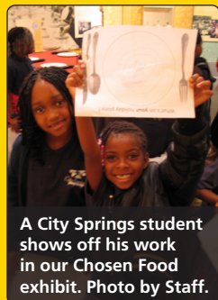
A City Springs student shows off his work in our Chosen Food exhibit.