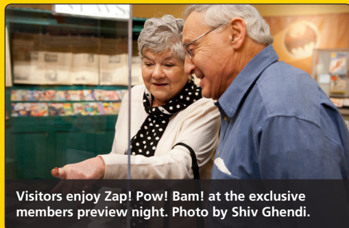
Visitors enjoy Zap! Pow! Bam! at the exclusive members preview night.