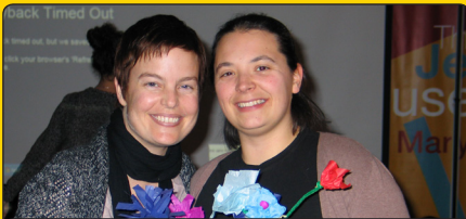
Two happy attendees enjoy classic movies and paper flower making at March's Late Night on Lloyd Street program.