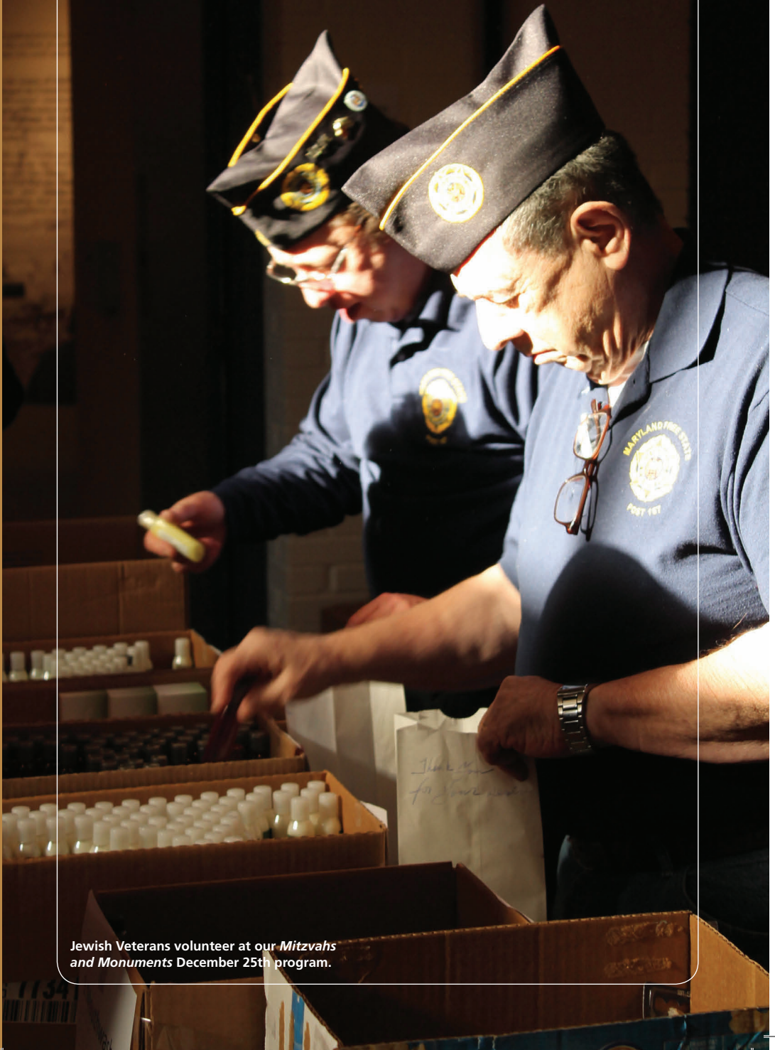
Jewish Veterans volunteer at our Mitzvahs and Monuments December 25th program.