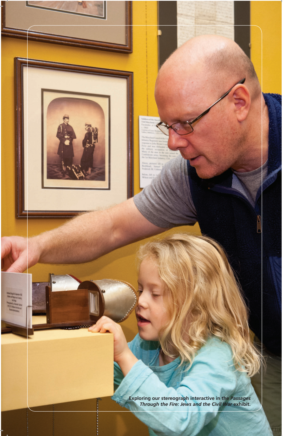
Exploring our stereograph interactive in the Passages Through the Fire: Jews and the Civil War exhibit.